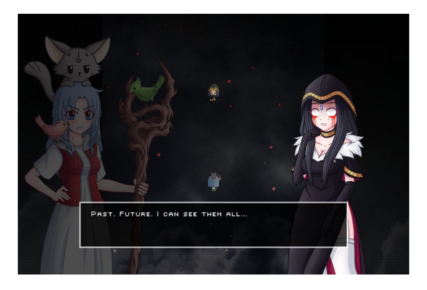
Jigoku Kisetsukan: Sense Of The Seasons Activation.rar